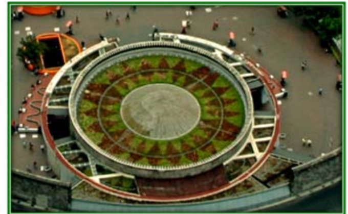
Insurgentes subway station, Mexico City