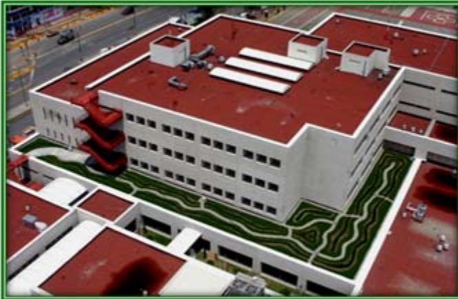
Belisario Domínguez Hospital, Mexico City