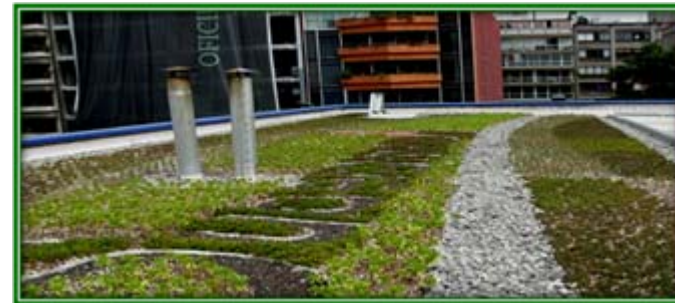
Superama Horacio (Supermarket), Mexico City