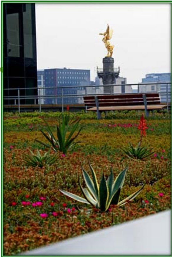
HSBC Reforma, Mexico City