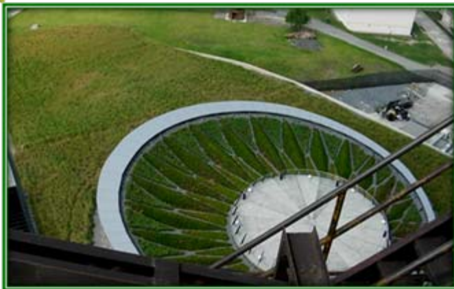
Steel Museum, Monterrey, Nuevo León