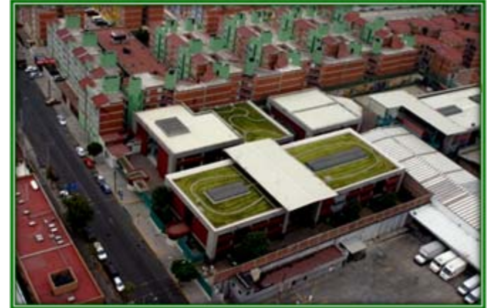
Preparatoria Iztacalco (High School), Mexico City