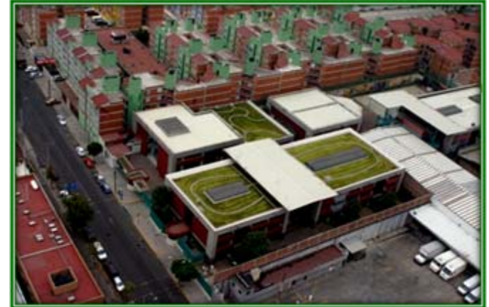
Preparatoria Iztacalco (High School), Mexico City