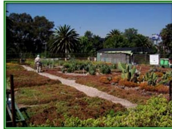
Rooftop Botanical Garden at CICEANA A.C., Mexico City