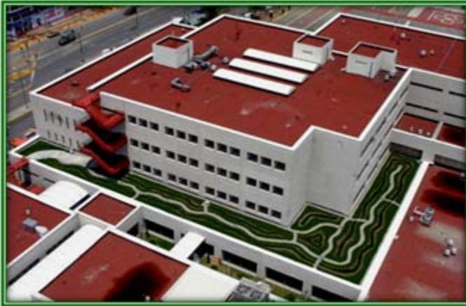
Belisario Domínguez Hospital, Mexico City