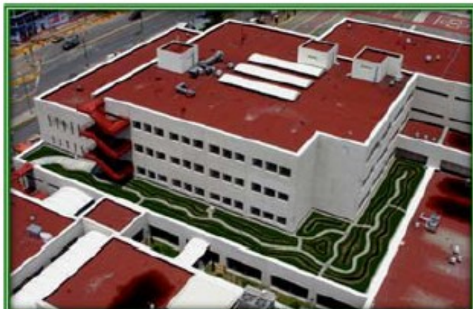
Belisario Domínguez Hospital, Mexico City