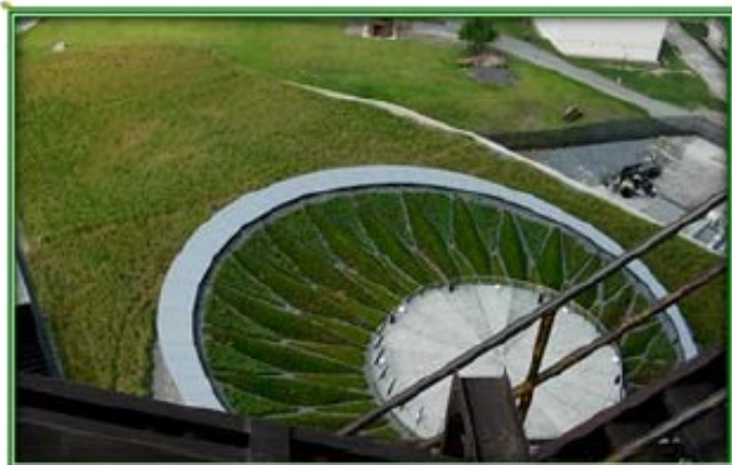
Steel Museum, Monterrey, Nuevo León