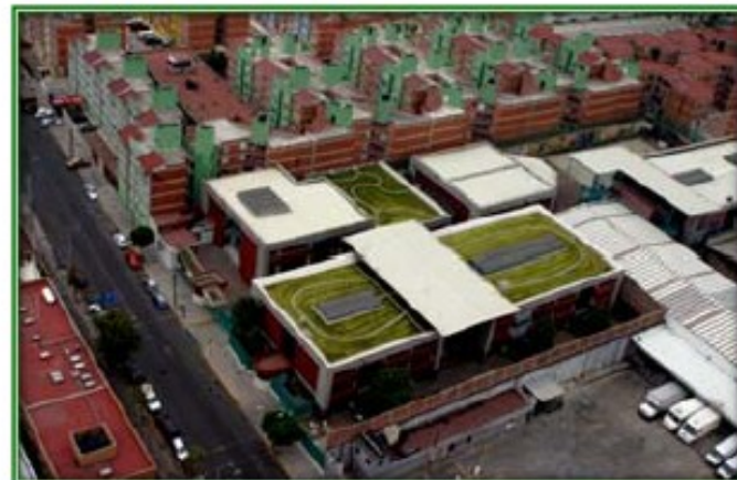
Preparatoria Iztacalco (High School), Mexico City