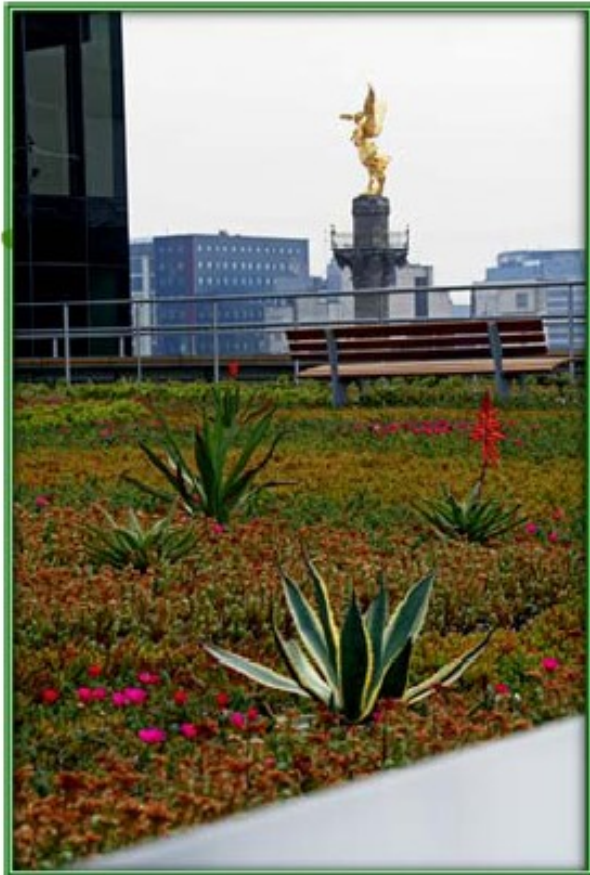
HSBC Reforma, Mexico City