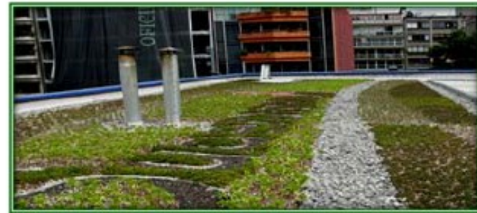
Superama Horacio (Supermarket), Mexico City