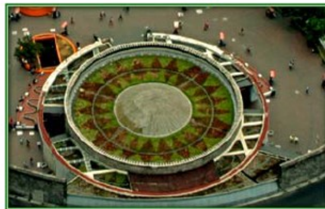
Insurgentes subway station, Mexico City